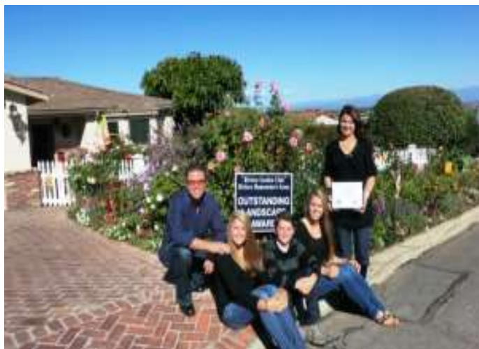
Nov. 2012—The Fitzpatrick Residence—459 Castellana. A variety of roses, a colorful brick walkway, and a white picket fence add country charm to this beautiful home.