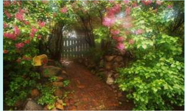
Along the Garden Path

The Costa Verde District will hold its general meeting on Wednesday, February 13, at the South Coast Botanic Garden. Social brunch: 9:30; business meeting: 10; program 11. Fee $2.00.